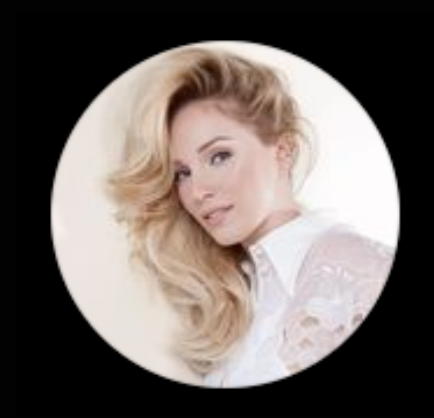
@bettinapohorelli Makeup Artist Party lover