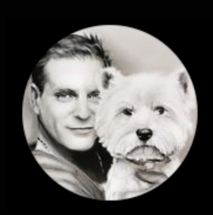
@csaba_kajdi Fashion Traveller

They might receive fancy PR packages filled with all the ingredients to whip up a Paloma cocktail, along with Mexican munchies and a cute little agave plant.