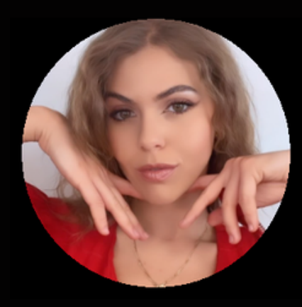
@ladyszomjas Spanish video creator Fashion lover